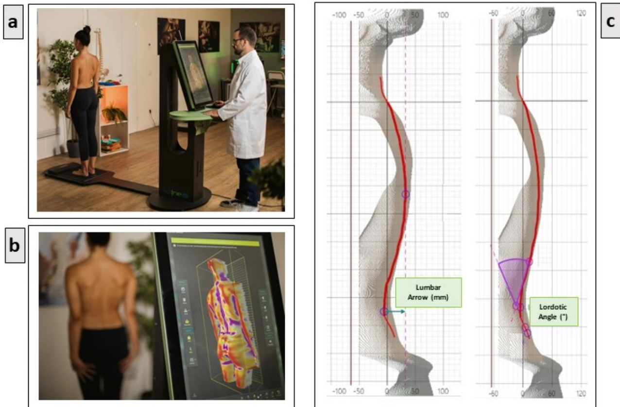
Figure 1. Spine3D non-invasive three-dimensional optoelectronic detection apparatus: (a) positioning of the subject during the assessment; (b) 3D spine reconstruction; (c) sample of software data for lumbar arrow and lordotic angle.

This system is equipped with an infrared (IR) time-of-flight (ToF) 3D RGB camera, which is mounted onto a motorized column and controlled via a joystick. The camera has a resolution of 1920 \times 1080 pixels at 30 frames per second (fps) for RGB imaging and 512 \times 424 pixels at 30 fps for depth resolution, with horizontal and vertical fields of view of 70^\circ and 60^\circ , respectively. The operational measurement range spans from 0.5 to 4.5 m. The ToF camera allows for real-time estimation of the distance between the camera and the participant. Participants were instructed to remove all upper-body clothing and position themselves with their back facing the camera at a distance of 110 cm, ensuring their heels were aligned. They were also asked to lower their pants to expose the intergluteal sulcus. The foot positioning was standardized using custom-designed footprints. Once the participant was in position, with their arms relaxed at their sides, they were directed to focus on a target placed 2 m away to stabilize their posture. The operator then adjusted the camera's position using a joystick to capture the area from the nape to the glutes. The Spine3D acquisition lasted 7 s. Each acquisition was repeated three times, with a 30 s rest period between repetitions. After each acquisition, the participants stepped away from the camera and then repositioned themselves for the next measurement.